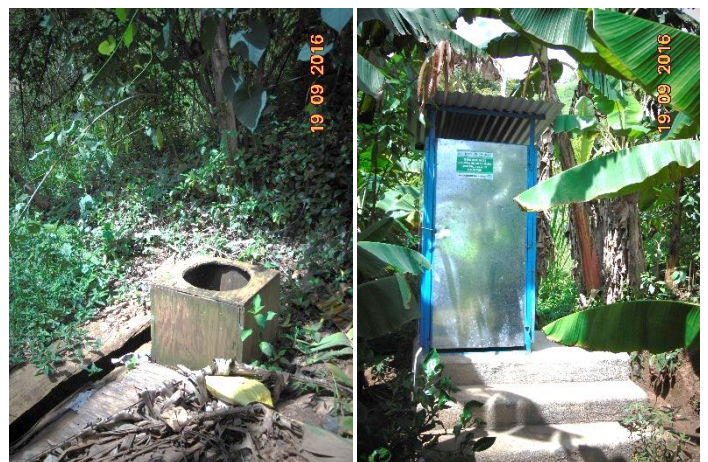
Latrines in Boca de Poteca, before and after the project.