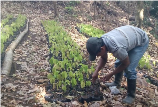
Boca de Poteca's plant nursery.

To prevent large animals from entering the area of the spring, it has been protected with a perimeter fence made from barbed-wire and wooden posts.