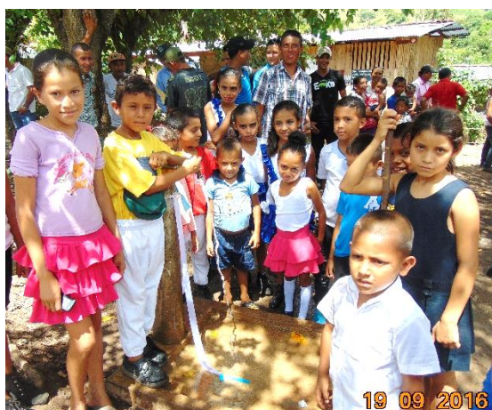
Proud children of Boca de Poteca posing next to the school's water station.

Agua Para La Vida Nicaragua would like to thank our Nicaraguan and international partners and friends; our donors, for believing in and supporting the hard work we implement with the rural communities of Nicaragua; the Executive Board of Agua Para La Vida, for their constant work and financial contributions; the Municipality of Wiwilí Nueva Segovia, for their economic and logistical support during the project implementation; the community members of Boca de Poteca, for their hospitality; and the APLVN team, without whom it would not have been possible to carry out this Water Supply and Sanitation Project for the community of Boca de Poteca, Municipality of Wiwilí Nueva Segovia, Nicaragua.