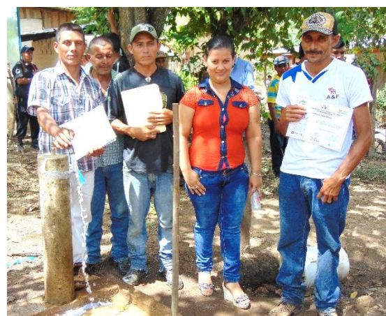
Some members of Boca de Poteca's CAPS.