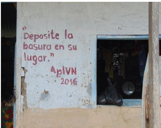
This message on the wall of a community store was a result of an awareness campaign on garbage management: "Put garbage in its place".

Each and every family that uses the project's drinking water services was trained with regard to the correct use and maintenance of the drinking water and sanitation systems. The objective of those workshops was mainly to be able to reduce the incidence of water-borne diseases. The groups who were prioritized for strengthening this preventive network were the following: household heads (mostly women), children of school age, and members of the CAPS.