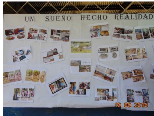
Photo board made by the community about the project execution, reading "A Dream Come True".

Finally, this report will provide insights on the challenges, lessons learned and a few practical recommendations regarding the project.