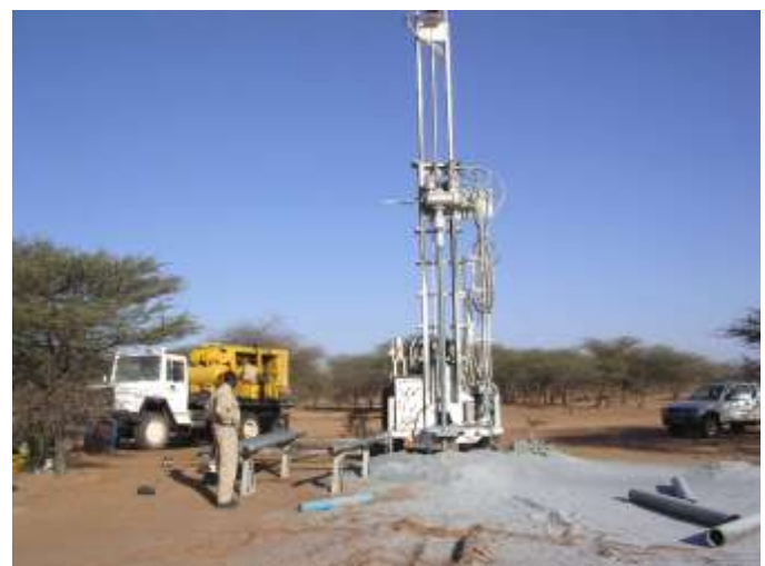
Figure 3: Water Well Drilling in Burkina Faso

From a social and economic perspective it is an advantage to the country when the know-how and revenues from drilling remain in the country. Exchange of experiences, for example could be coordinated by a drillers association.