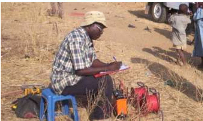
Figure 3: Siting – Resistivity Survey in Niger State, Nigeria

In some cases siting is undertaken by a consultant, who may also supervise the drilling. In many countries, the drilling contractor is expected to site the well, and is shouldered with the blame if it is dry, i.e. "no water no pay". The driller and the community may be expected to locate two or three suitable sites within a particular village, in order of preference.