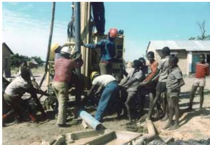
Figure 4: Installation of Casing

It is important to remember that the price of materials can vary according to world demand and the price of oil and steel. Screen and casing is particularly vulnerable to this. By the time award of contract occurs there may have been a price increase. You should also consider the cost of collection and delivery of these materials and of course of damage in transit, which frequently occurs. If you carry the materials as stock items, you may have bought them cheaper than the current price. Your quote should allow for the replacement cost.