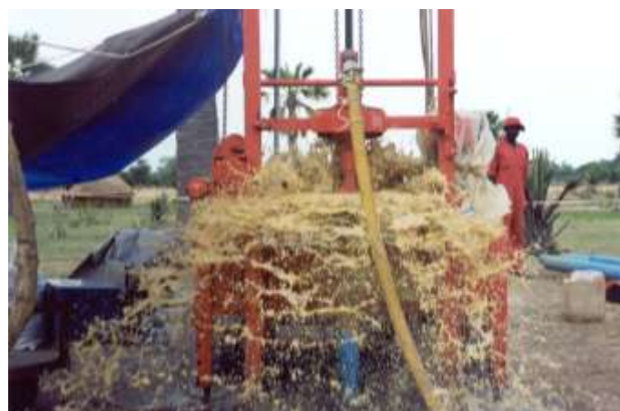
Figure 5: Well Development using Compressed Air

Table 7 sets out an example of the cost of well development and pumping test. The duration and hence actual cost of well development is not known until it is completed and the water is clean of fine materials. You will thus need to estimate your costs, based on prior knowledge of the area and available information.