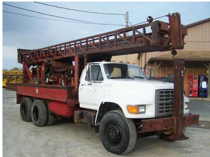
Figure 1: Schramm-T6HB Drilling Rig

This field note is based on available information, and tools, discussions with drillers and analysis of drilling costs. We sincerely hope that it can assist drilling enterprises to realistically calculate their costs, determine competitive prices and thus flourish! It should also be of assistance to agencies as they design tender documents.