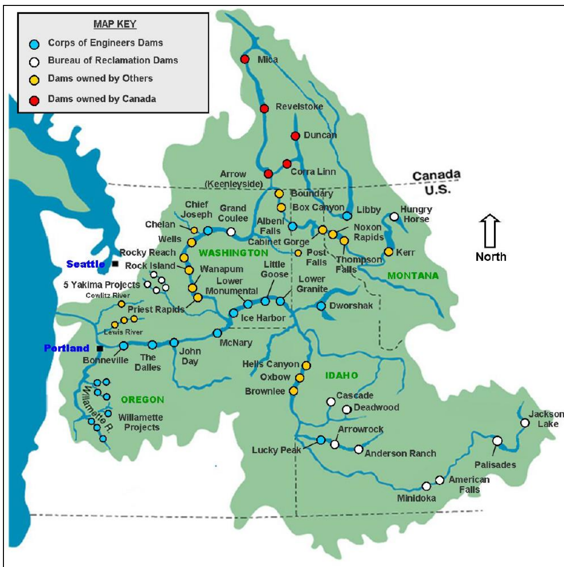
Figure 1. Columbia River Basin and Dams