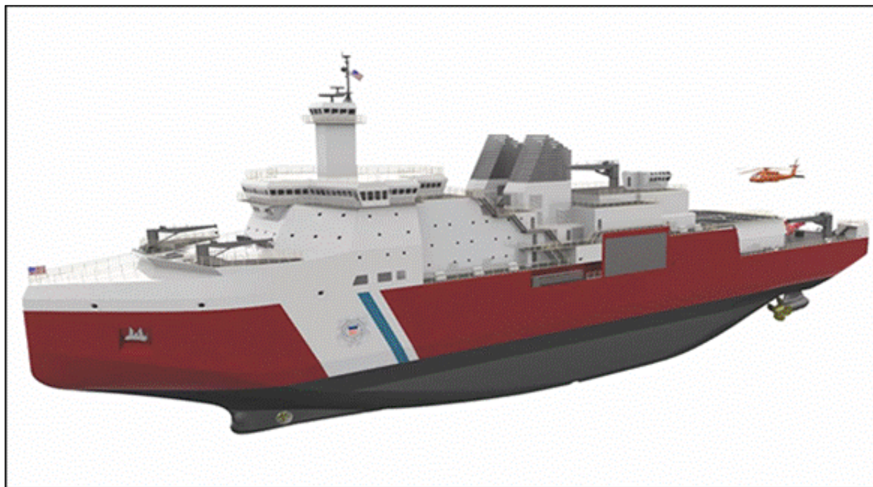
Figure 1. Rendering of PSC Design