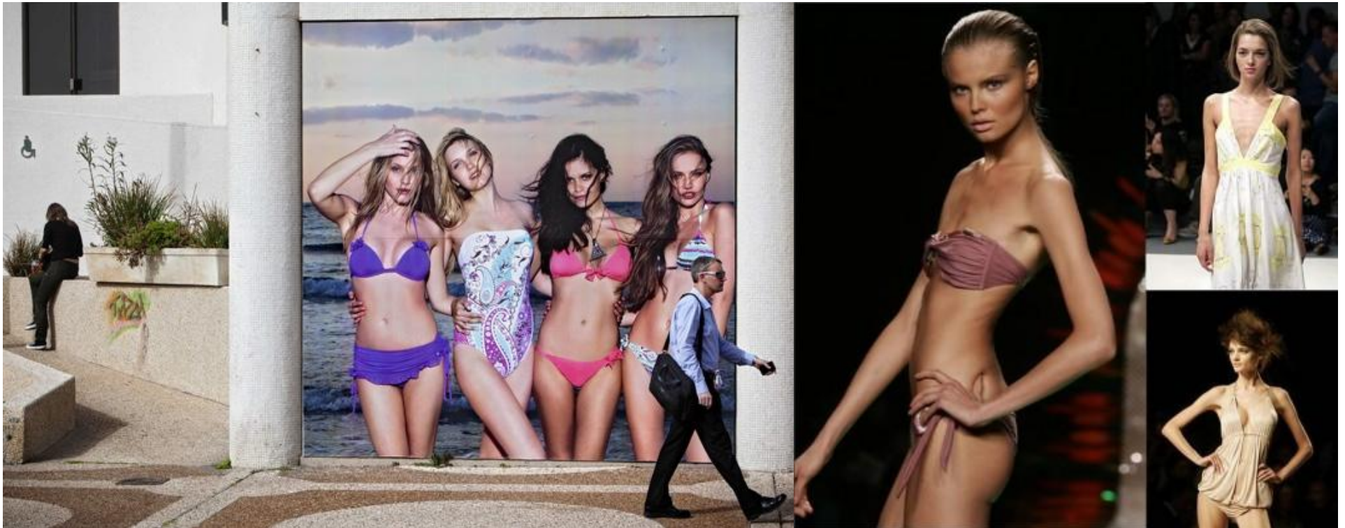
An Israeli walks past an advertising displayed on a main street in Tel Aviv, Israel, on Monday, March 19, 2012, left. Related, right.

Isaiah 49:13: Shout for joy, O heavens; rejoice, O earth; burst into song, O mountains! For the Lord comforts his people and will have compassion on his afflicted ones. Did Isaiah prophesize an Israeli government's compassion for underweight and malnourished fashion models? Israel now banned them from public display, according to newspapers. With internal extremists and ultraorthodox, rapidly growing non-Jewish minority, declining Jewish immigration, growing inflation, high oil and housing prices, hostel neighbors, Iranian threats and nuclear power, Syrian revolution, Egyptian winter, Barak Hussein Obama and Hillary Clinton, US re-arming of Egyptian military, etc. there might be bigger issues on the Jewish State's agenda, whot.