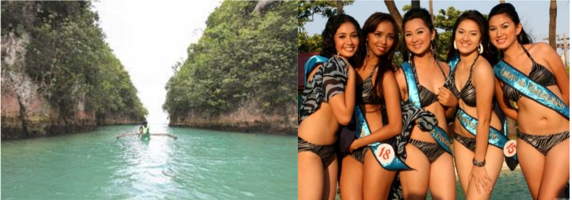
New tourism destination: river cruise at scenic Bojo River, Barangay Aloguinsan, Cebu, Philippines (Manila Bulletin), left; Beauties Galore (Pangasinans' News Leader, Sunday Punch), right

Planning to return to my desert home in Tucson next week, and wondering about this note in the New York Times, reprinted in the Manila News on March 17, 2012. It reads, “When Odysseus, disguised as a beggar, returned home after 20 years of war and wandering, his aged dog, Argos, knew him instantly. ‘Infested with ticks, half dead with neglect’ and lacking the strength even to drag himself toward his master, Argos thumped his tail, nuzzled low, and dropped his ears in grateful recognition. Then the ‘dark shadow of death closed down on Argos’ eyes.’”